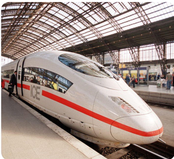
ICE Train in Germany.