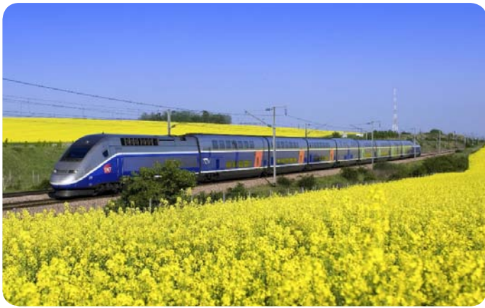
TGV train in France