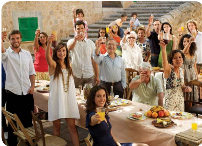
Travelers in Italy.

Most stations offer services such as currency exchanges, shops, information desks, restrooms, restaurants and more. You can unwind at Europe's longest champagne bar at London's St. Pancras. Enjoy high-end fashionista shopping at Milan Centrale. And how about a little art infusion at Madrid's Atocha Train Station, home to a permanent sculpture display? You'll also find that many of Europe's train stations are hubs for other transportation like local buses.