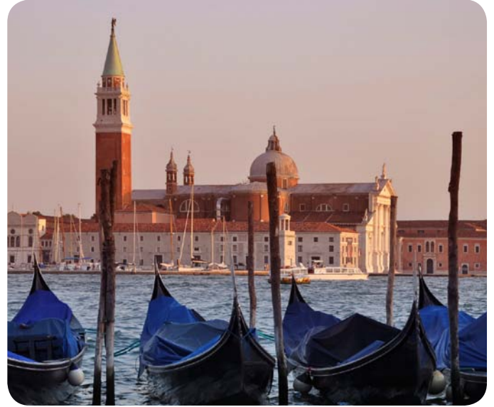
Grand Canal in Venice, Italy