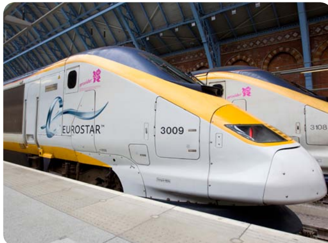
Eurostar train in St. Pancras International in the UK

“ Train travel gives you an opportunity to just look out and see the beautiful countryside and to share it...from 30,000 feet up on a plane you don’t see a whole lot. ” – Kyle & Barbara