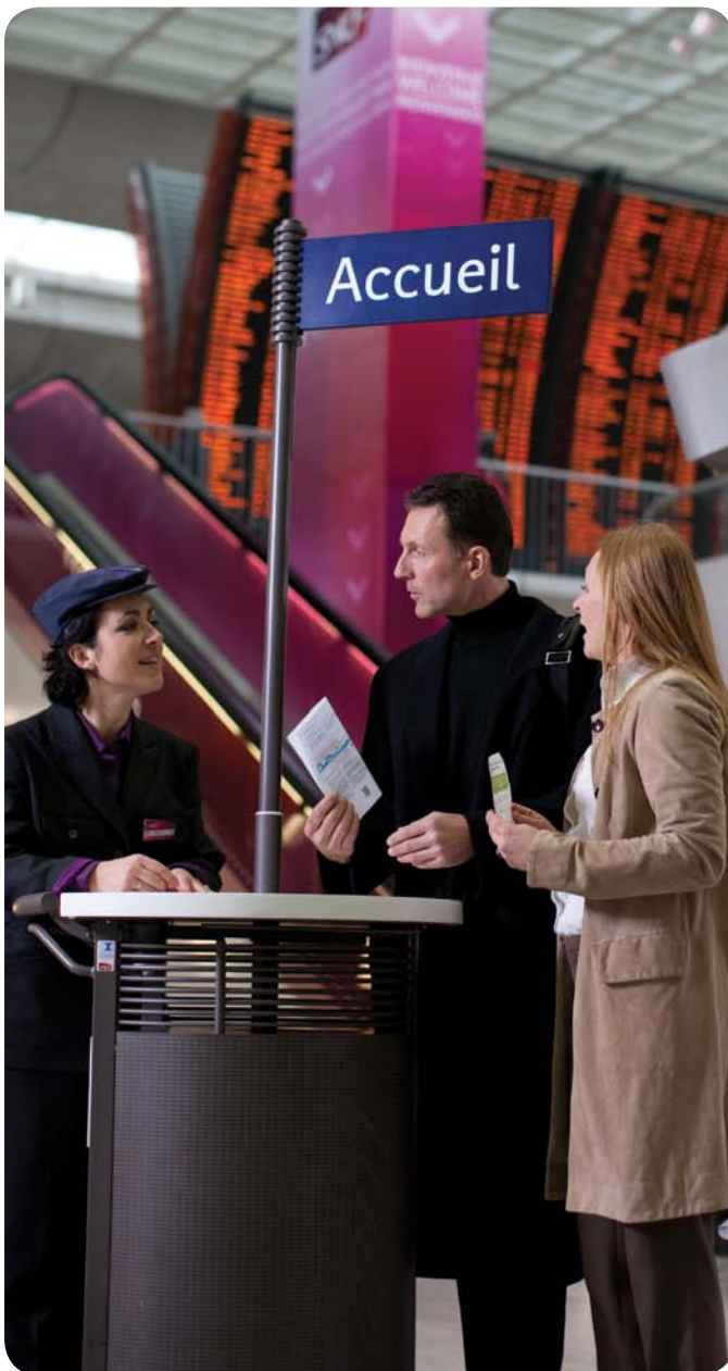
Train Station at Charles de Gaulle, Paris Airport

If you're booking a ticket on our website that offers reserved seats, we'll reserve them and it's included in the cost of the ticket. With a rail pass, the cost for a reservation is an additional fee. But reserve it when you buy your pass and you'll be sitting pretty and stress free.