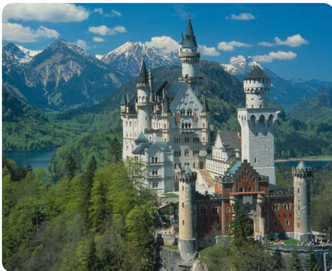
Neuschwanstein Castle in Germany